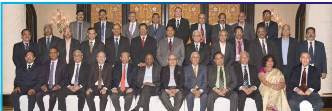
Bank's Board of Directors and Other Senior Officials at the Annual Strategy Meet

The Net Profit has registered YoY growth of 1580.31% (from a profit of ₹ 862 Cr in FY19 to Net Profit of ₹ 14,488 Cr during FY20) as against YoY growth of only 9.79% in Net worth of the Bank (from ₹1,78,552 Cr in FY19 to ₹1,96,037 Cr in FY20).