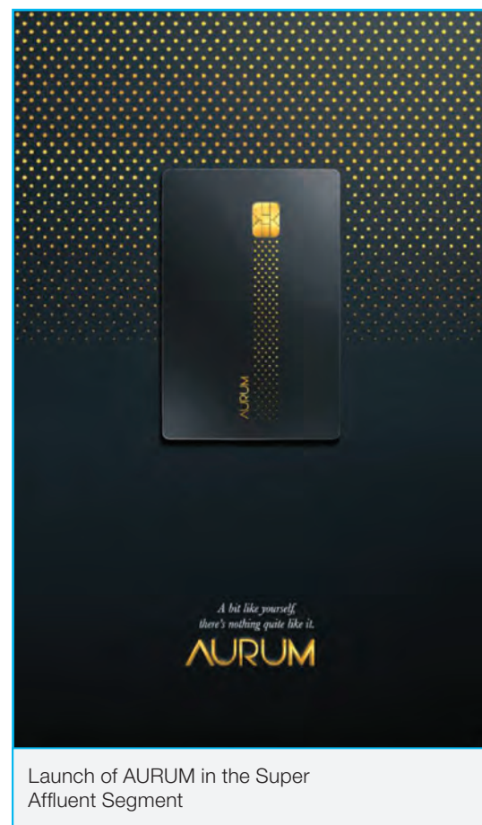
Launch of AURUM in the Super Affluent Segment

Forces) and State Government employees and one of the seven PFMs appointed for management of Pension Funds under the Private Sector. The total Assets Under Management (AUM) of the company as on 31 st March 2021 was ₹2,22,615.34 crores (YoY growth of 39.00%) against ₹1,60,491.55 crore on 31 st March 2020.