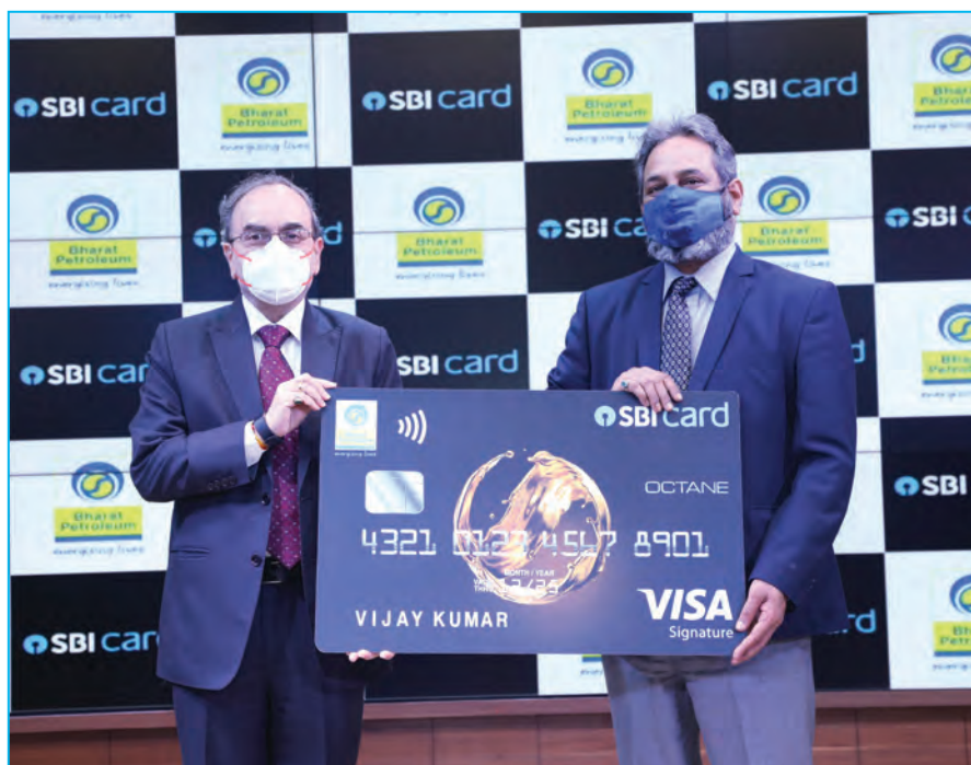
Chairman SBI & MD BPCL Launching BPCL SBI Card OCTANE

Education is one of the most important tools to bring about a socio-economic transformation within society. However, not all sections of the society have equal