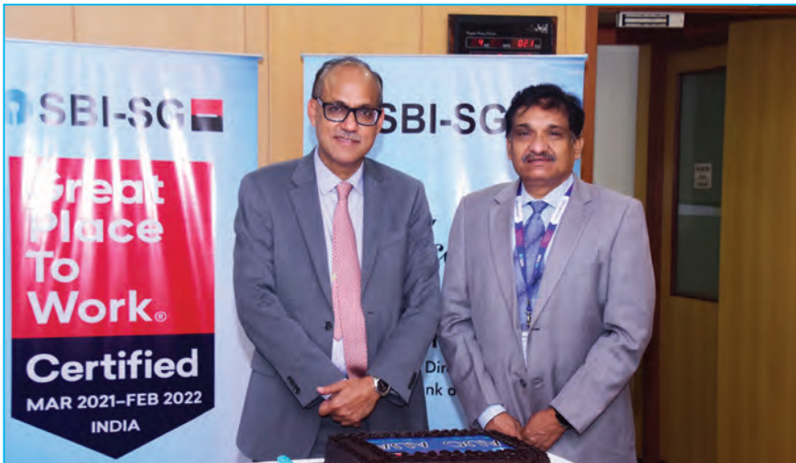
Celebration of being certified Great Place to Work in the presence of MD (IB, T &S)".