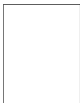
1 st Holder

6. Latest photograph of the account holder(s)