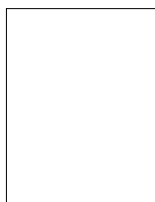
2 nd Holder