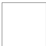
Seal of the Bank