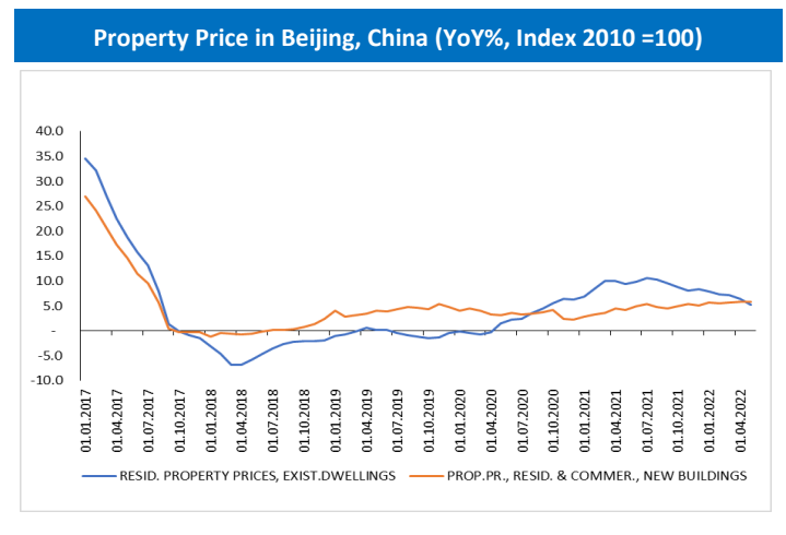
Source: BIS Detailed Residential Property Price Statistics, July 22, SBI Research