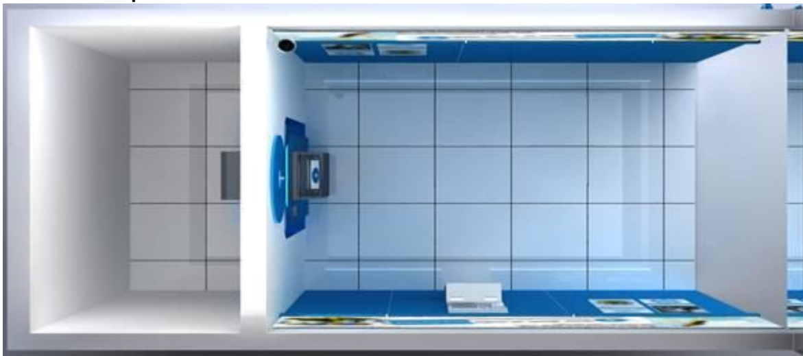
c. Rolling shutter for ATM Room.